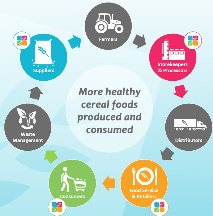
HGF Influence on the Food Value Chain